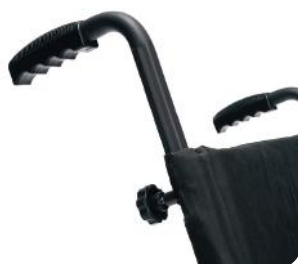
Height adjustable push handles