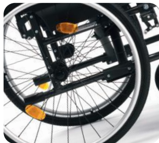
Rear wheels with quick-release system