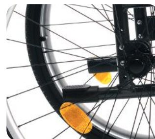
Two tipping pieces