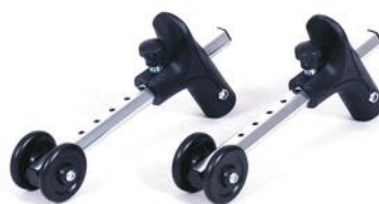
Option B78 - Anti-tipping wheels