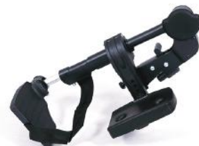
Option BZ8 - articulated legrest self-correcting in length