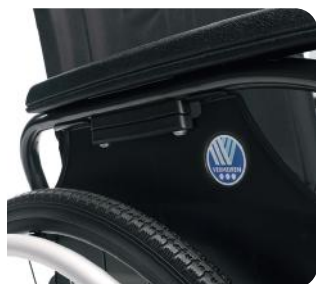
Armrests adjustable in height and depth to suit specific need