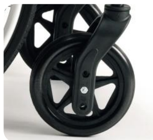
Adjustable front wheels