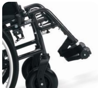
Removable swing-away leg rests (in and outwards)